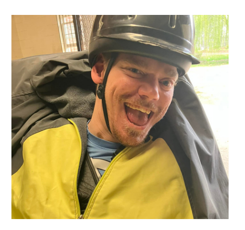
JR having a great time at Riverwood!