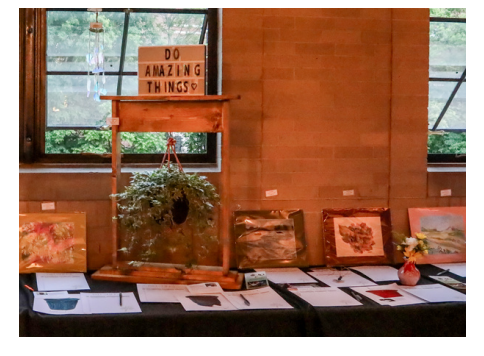
The Community Art Show and Silent Auction was a huge success!